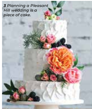
3 Planning a Pleasant Hill wedding is a piece of cake.