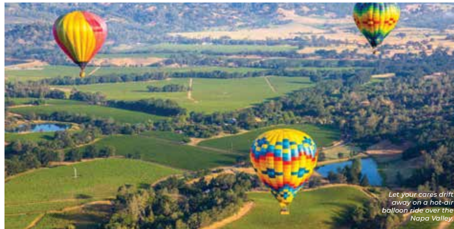
Let your cares drift away on a hot-air balloon ride over the Napa Valley.