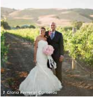
1 Gloria Ferrer in Carneros

San Francisco has long served as an all-inclusive wedding destination for couples from around the world. Exchange your vows overlooking the San Francisco Bay at Fort Mason Center ; bring the whole crew to 620 Jones , a stunning rooftop restaurant that can accommodate up to 1,000 guests; or take in the historic splendor of the Julia Morgan Ballroom .