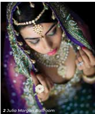
2 Julia Morgan Ballroom