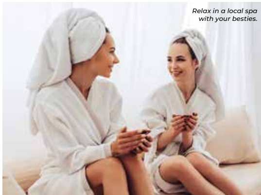
Relax in a local spa with your besties.