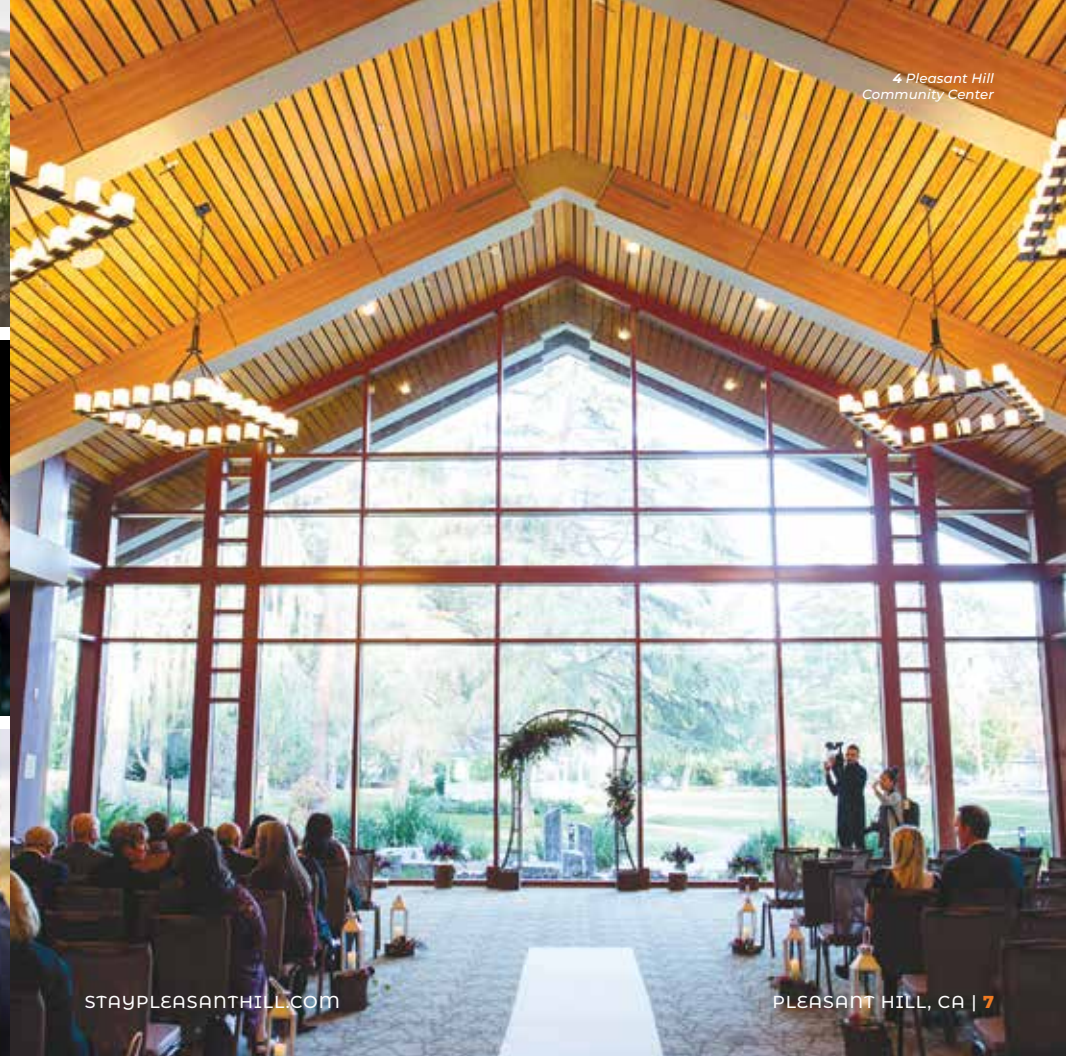
4 Pleasant Hill Community Center