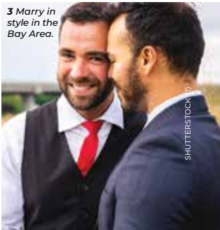
3 Marry in style in the Bay Area.