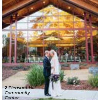
2 Pleasant Hill Community Center

Or if you're in town for engagement photos, make the gentle trek to Dinosaur Hill for panoramic views of the valley below.