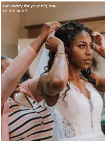
Get ready for your big day at the hotel.