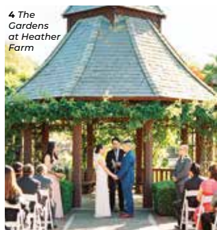
4 The Gardens at Heather Farm